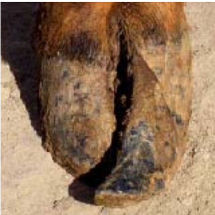
Scissor claw is a common overgrowth defect