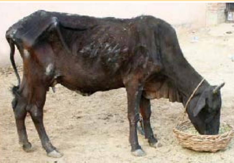
Bhumi before - malnourished and covered in maggot infested skin ulcers

For information regarding Care for Cows Land Fund, Sponsor a Cow, Feed the Herd, or to make a contribution on-line, please visit www.careforcows.org or email kurmarupa@careforcows.org