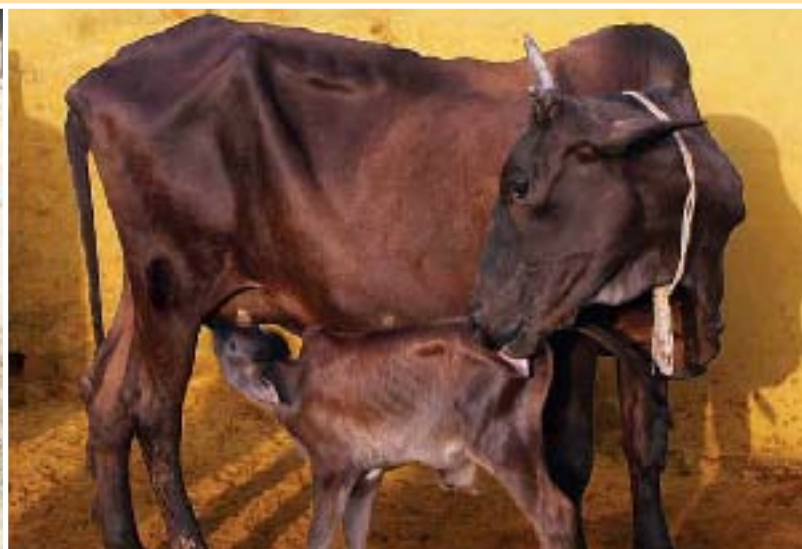
Bhumi today - fully recovered, her glossy, rich coat reflects her good health