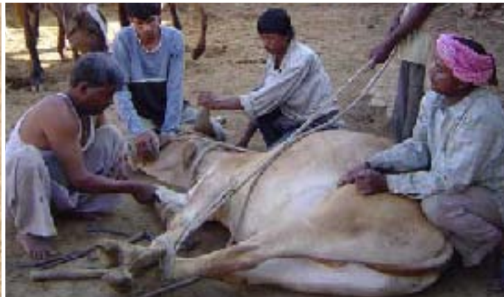
Each cow tended is carefully positioned, tied and held still to avoid injury