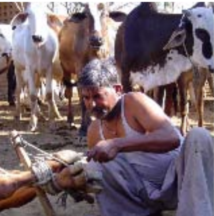
An expert craftsman scrutinized by the herd

The Nalwalla was careful to collect all the nail trimmings as he said if the dogs eat them, they can become sick and die.