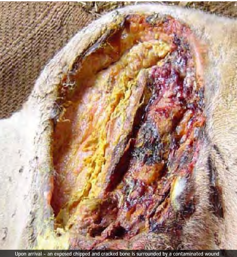
Upon arrival - an exposed chipped and cracked bone is surrounded by a contaminated wound

Sati, the older calf in the dog attack sustained the worst injuries with a large chunk of flesh stripped from the bone at her shoulder. A deep seated pocket of infection in her right underarm has cleared and the wound is reducing in size as it heals. Her whole body is scarred with teeth and scratch marks sustained in the attack. As she heals she needs nutritious food, rest, and lots of love and encouragement.