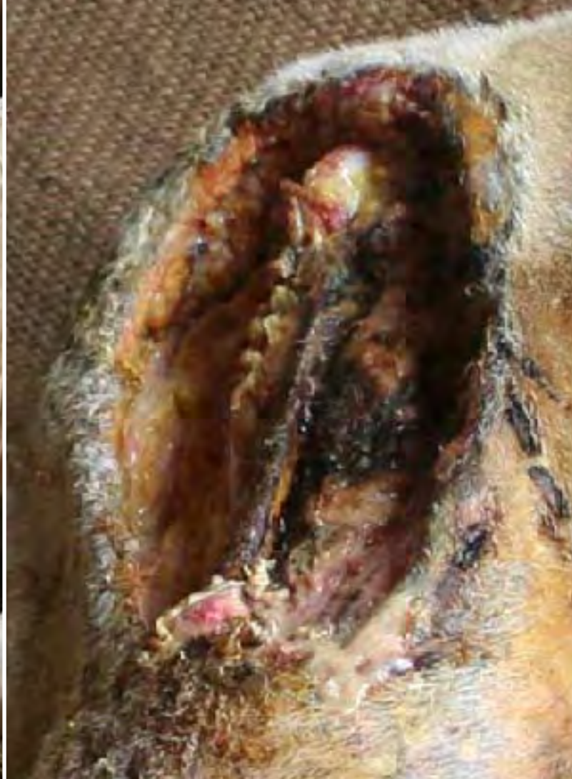
13 July 2007 - Sati's demeanor is testimony of her dejection and suffering. Her wound is infected and squirming with maggots.