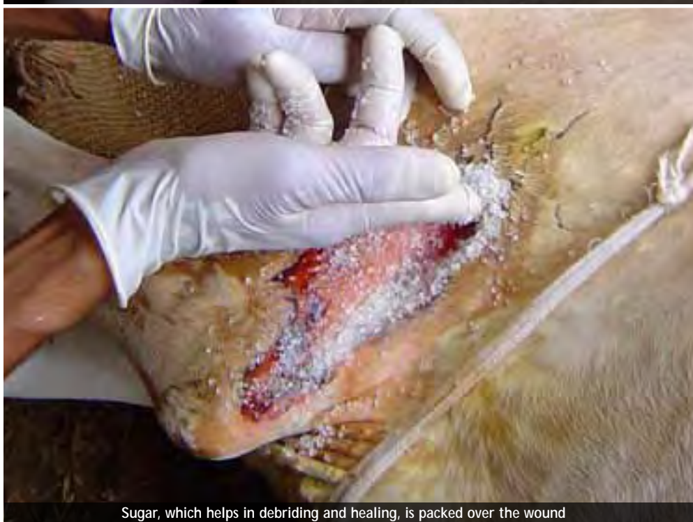
Sugar, which helps in debriding and healing, is packed over the wound