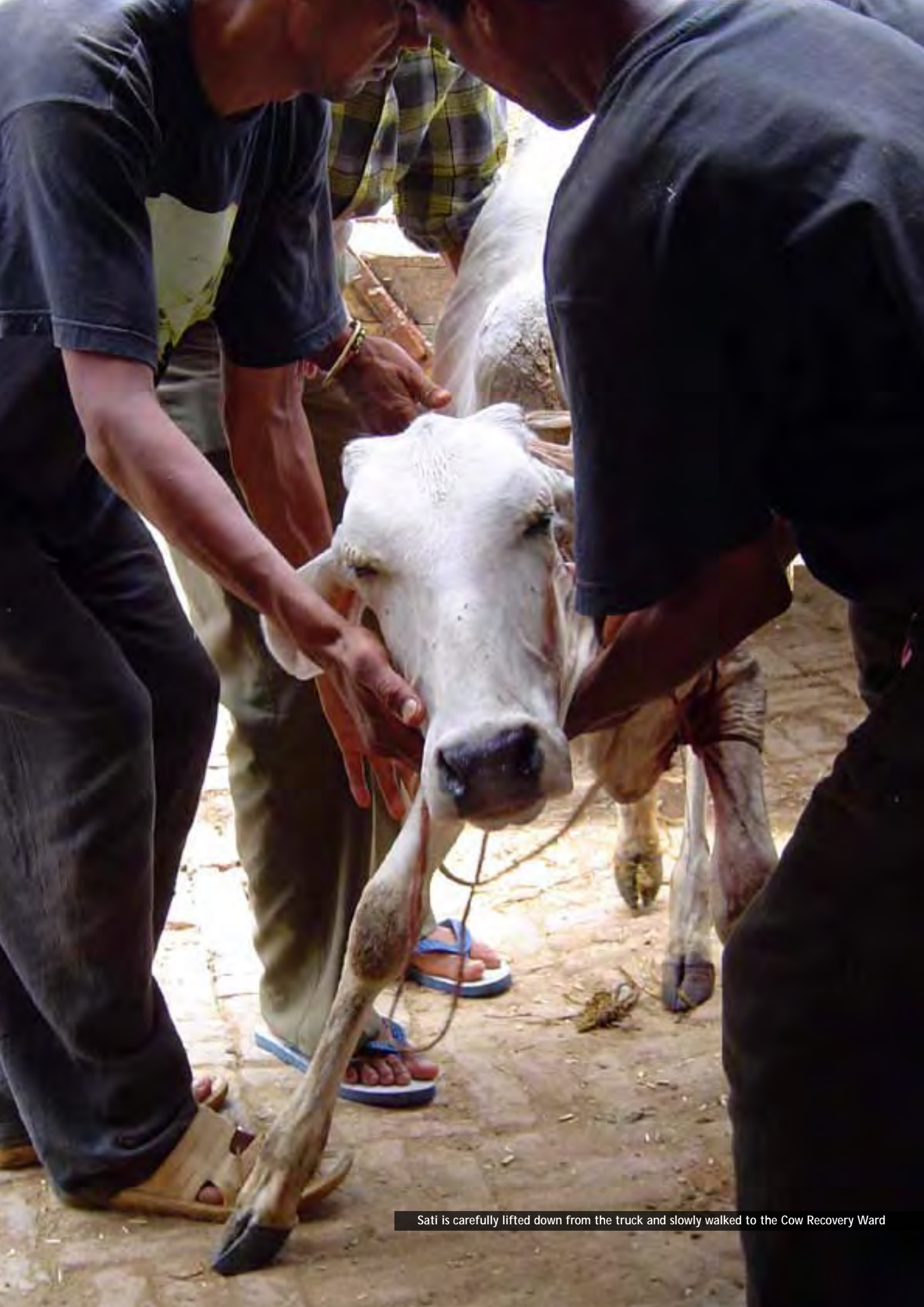
Sati is carefully lifted down from the truck and slowly walked to the Cow Recovery Ward