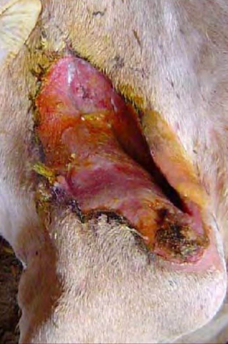
13 July 2007 - Rukmini's wound at first cleaning on arrival at CFC