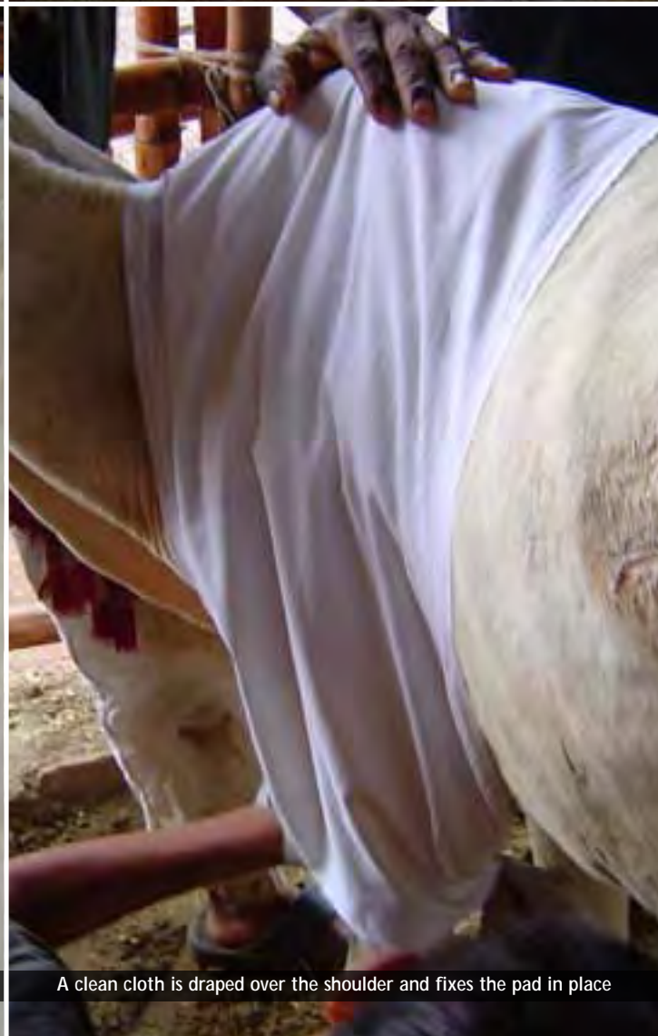
A clean cloth is draped over the shoulder and fixes the pad in place