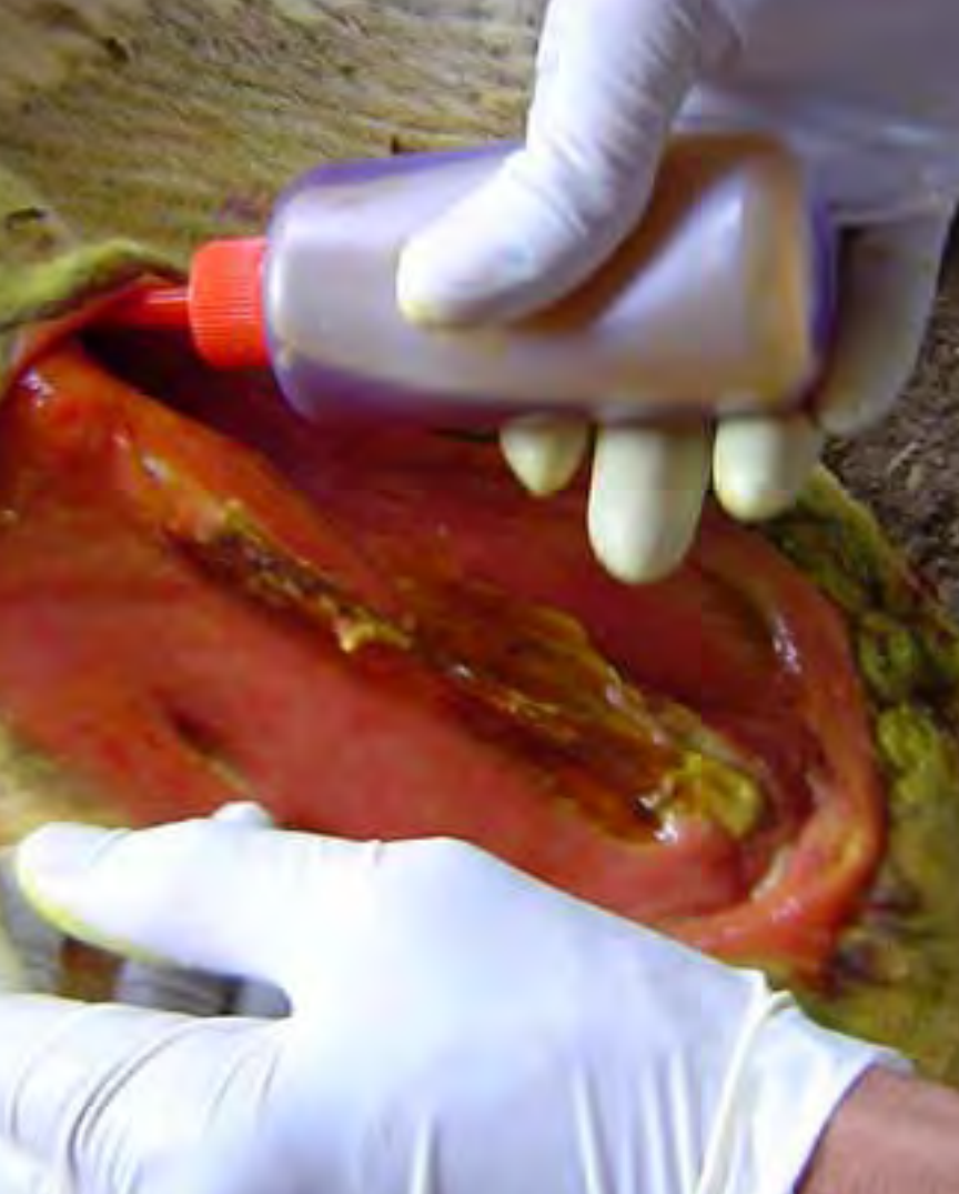
Unpasteurized honey is squeezed through a long sterile nozzle into hard to reach places