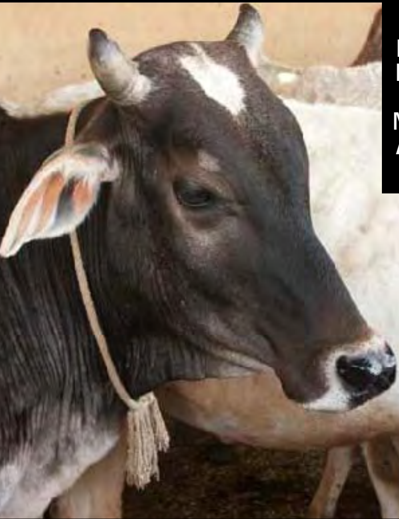
Bhima in winter black