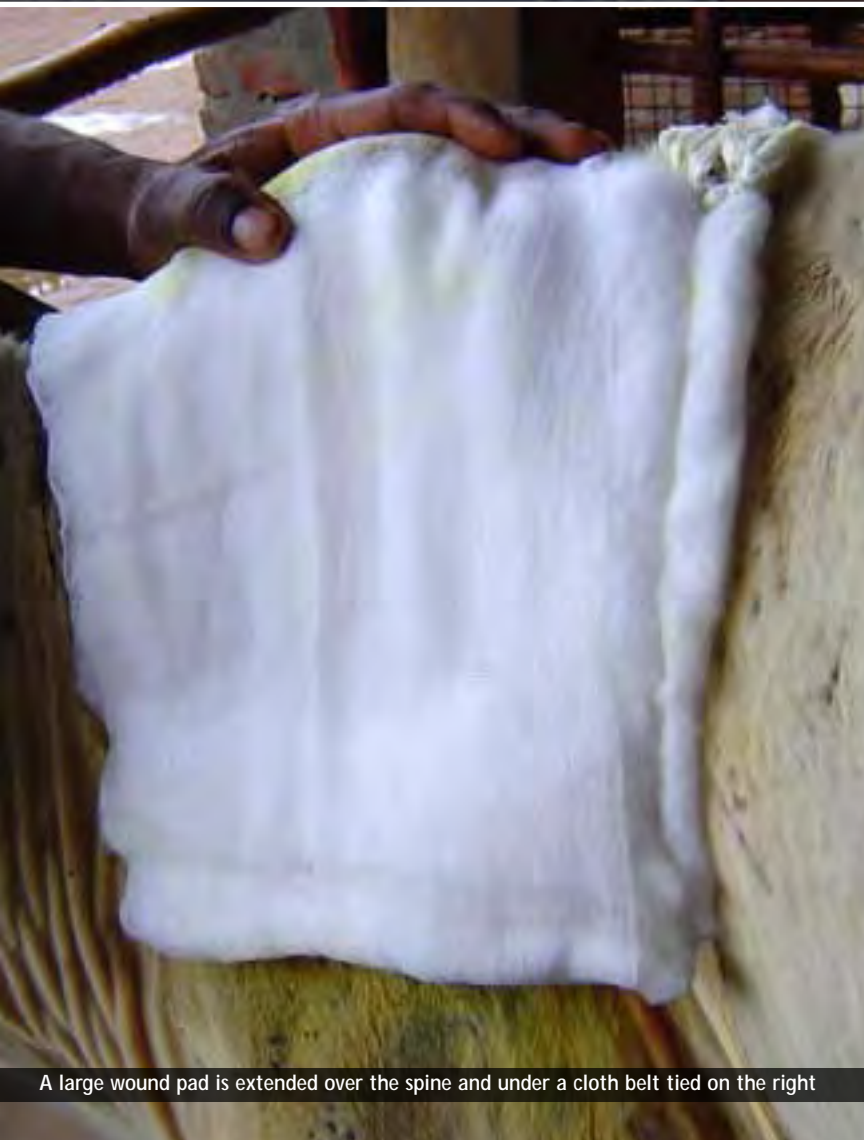
A large wound pad is extended over the spine and under a cloth belt tied on the right