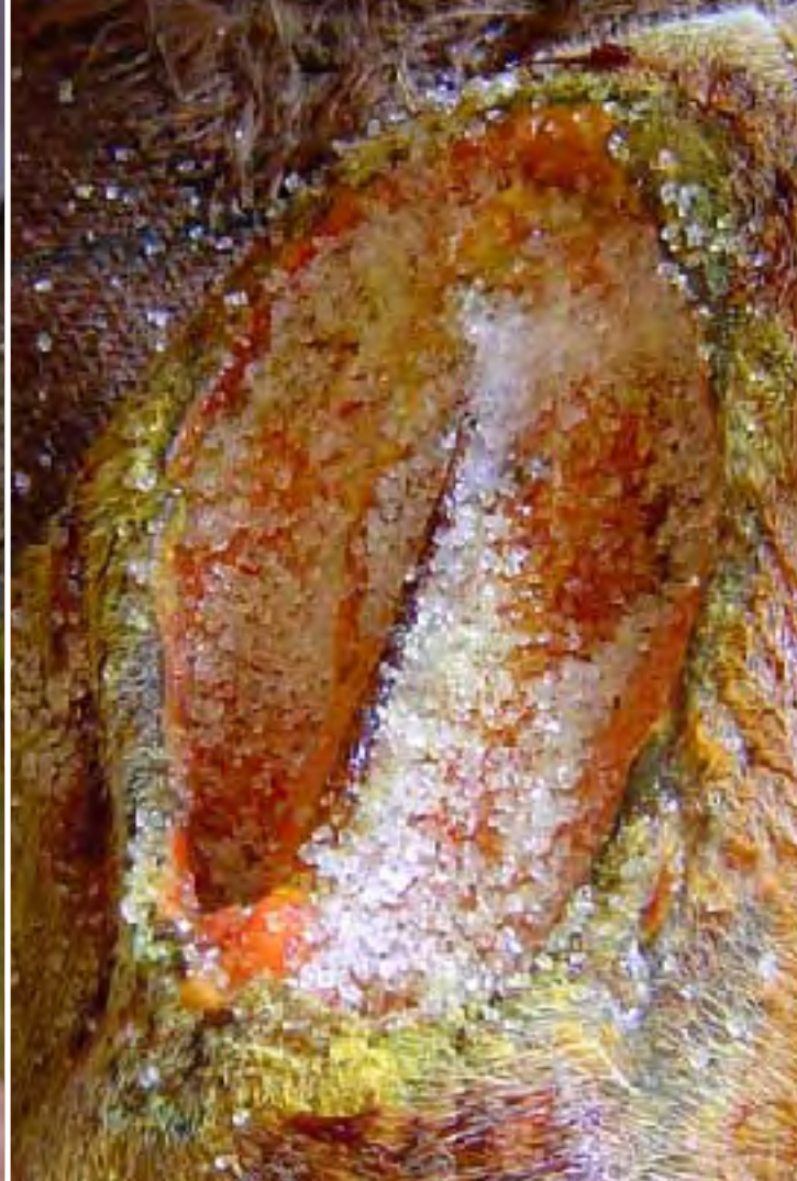
Cane sugar is packed over the surface of the wound