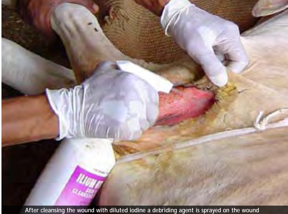
After cleansing the wound with diluted iodine a debriding agent is sprayed on the wound

By month end Rukmini's wound has completely filled out and is in the final stage of healing.