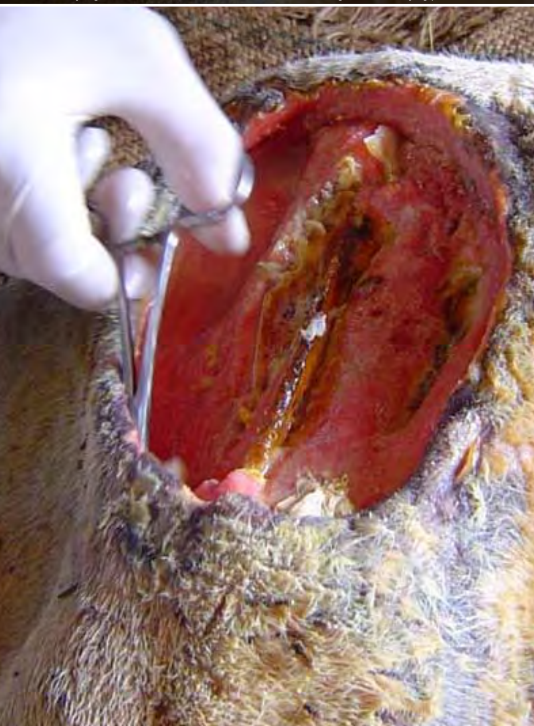
Using sterile forceps cotton swabs clean every nook and corner