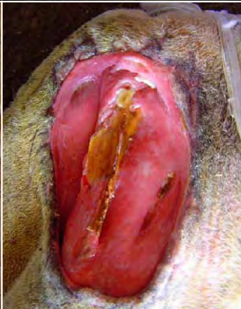
28 July 2007 - Sati looks as bright and effulgent as her wound, which is flourishing with healthy new tissue that is gradually covering the exposed bones