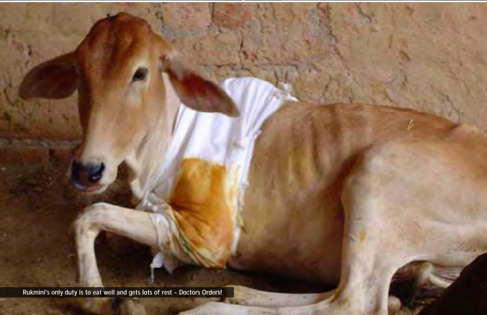
Rukmini's only duty is to eat well and gets lots of rest - Doctors Orders!