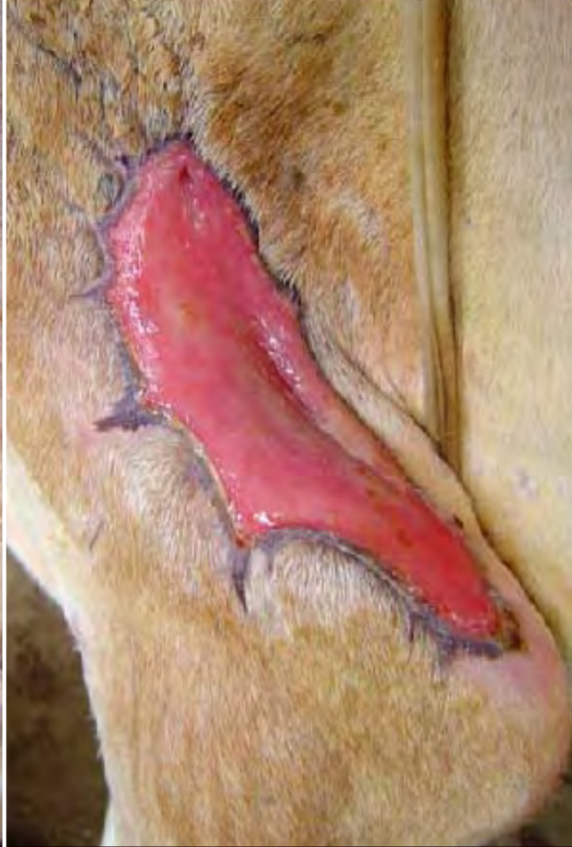
28 July 2007 - Rukmini's wound shows excellent healing after 15 days of care