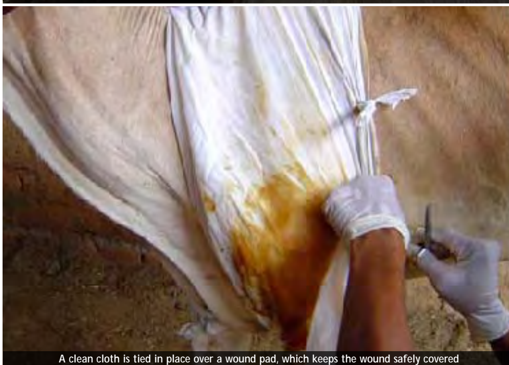
A clean cloth is tied in place over a wound pad, which keeps the wound safely covered