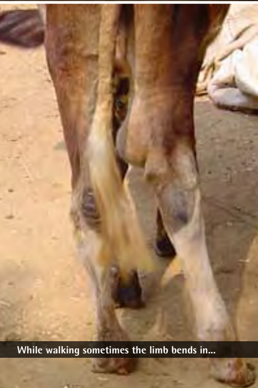
While walking sometimes the limb bends in...