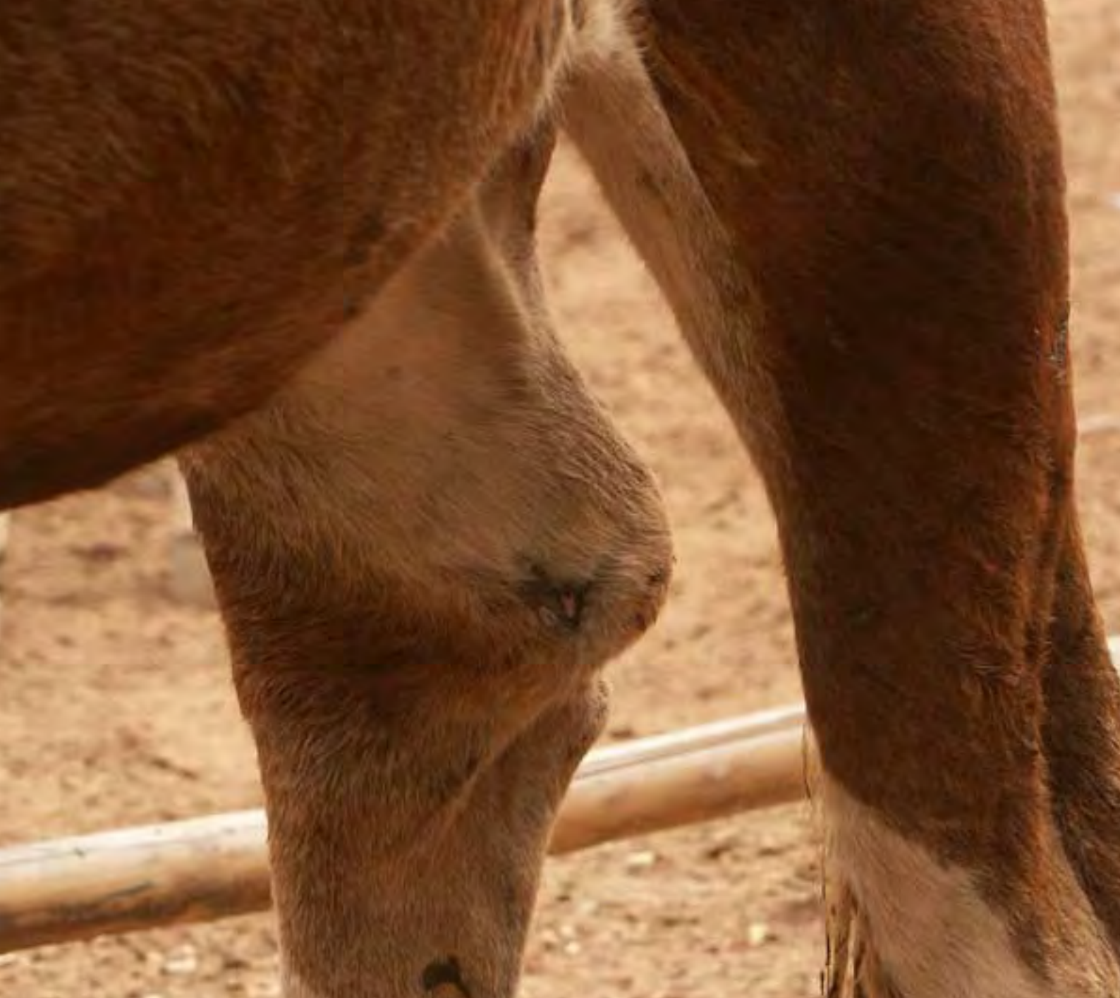
Tungavidya's fractured back leg healed on it's own without the bones connecting. Now the bone ends have sealed over, and are held apart by fibrous tissue.