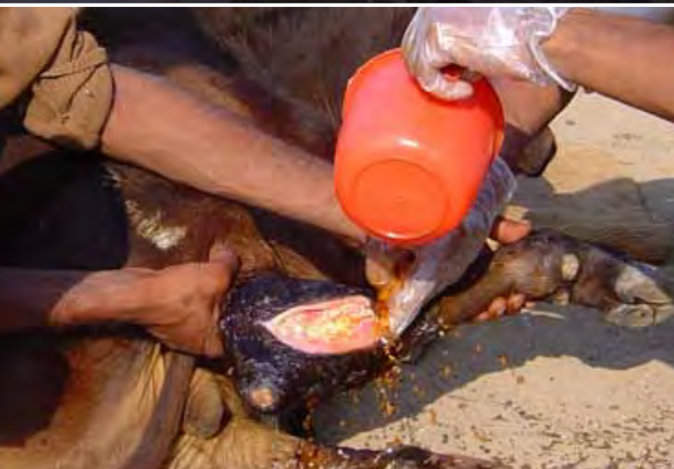
Daily wound cleaning is carried out, starting with flushing the wound with lots of diluted iodine