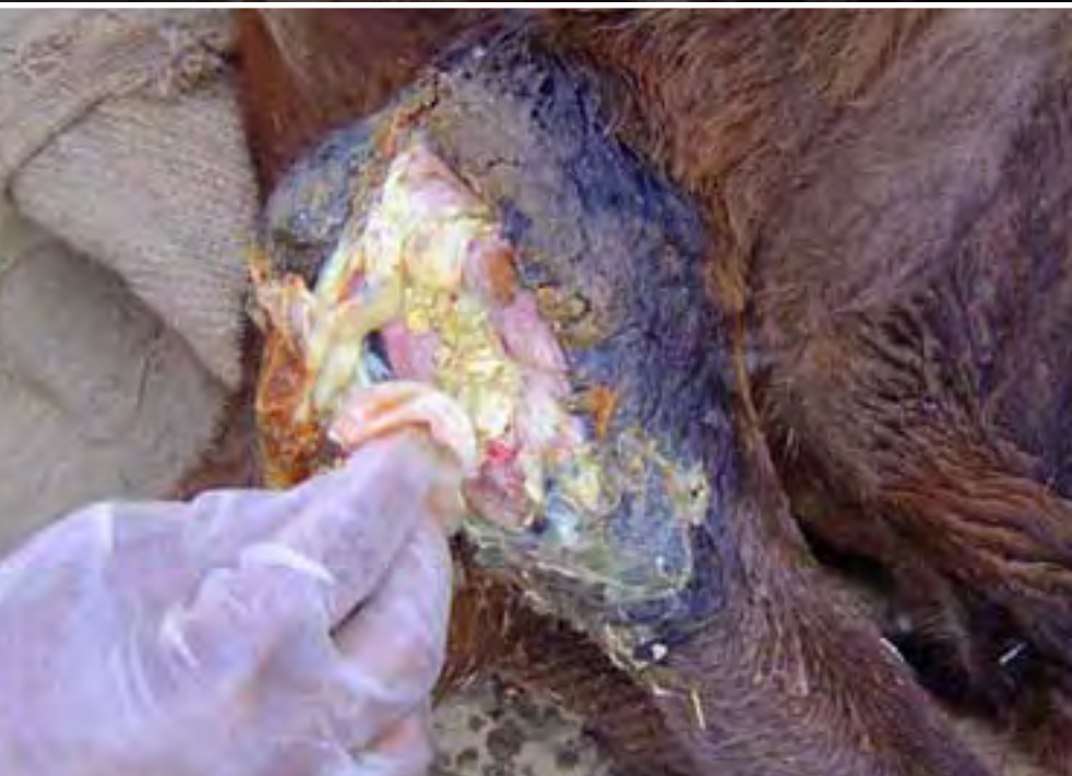
An old bandage is removed to reveal a badly infected wound, covered in a half inch layer of pus