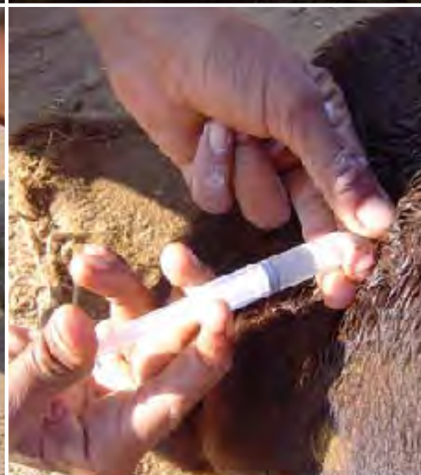
Antibiotic and anti-inflammatory injections are given