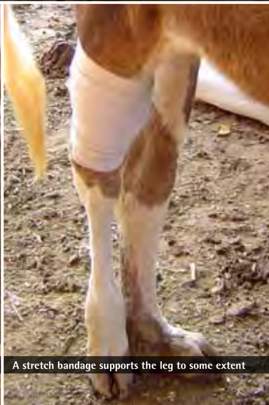
A stretch bandage supports the leg to some extent