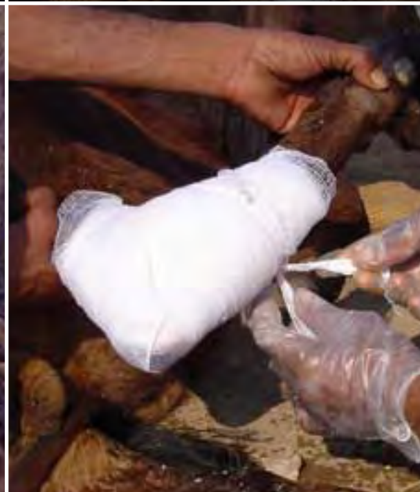
Dressing with a wound pad and gauze bandage