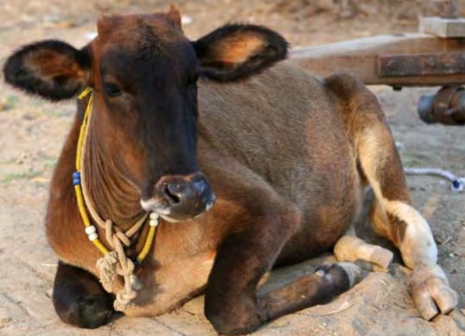
Tungavidya, relaxed and content at Care for Cows