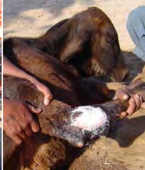
Sugar packed on the wound gives fantastic healing results