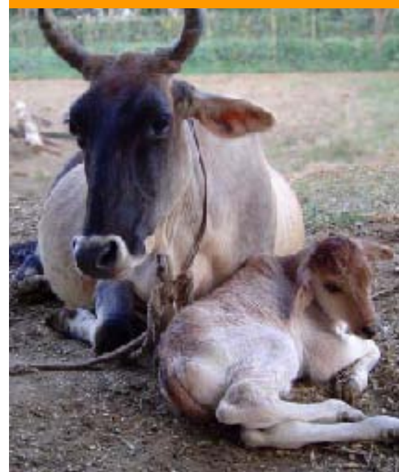
Suradasi, our champion milker, with her new born calf

Suradasi, long time resident at Care for Cows, lost 100% of her vision in both eyes as a result of insecticide carelessly being sprayed in her face. She has a separate area to walk in the day, keeps company with our recuperating patients, and has been known to mother orphaned calves, letting them suckle her milk.