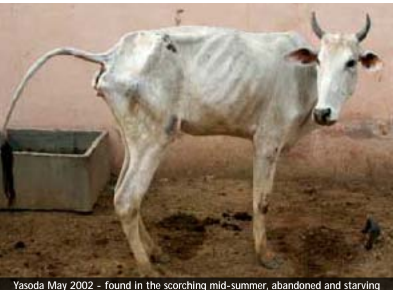
Yasoda May 2002 - found in the scorching mid-summer, abandoned and starving

For information regarding Care for Cows Land Fund, Sponsor a Cow, Feed the Herd, or to make a contribution on-line, please visit www.careforcows.org or email kurmarupa@careforcows.org