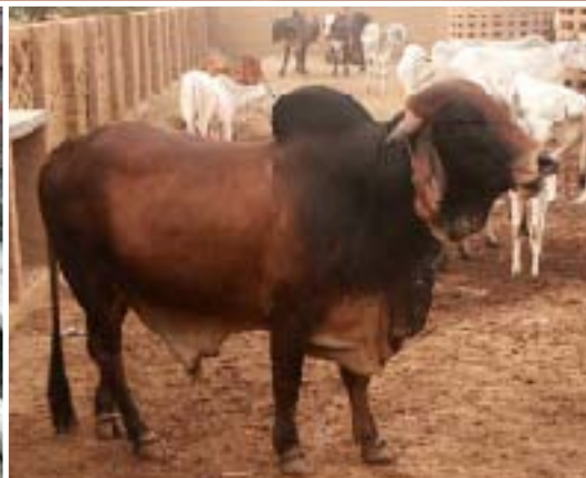
Nandi's long tail swept down to touch the ground