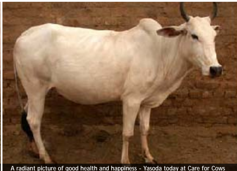
A radiant picture of good health and happiness - Yasoda today at Care for Cows