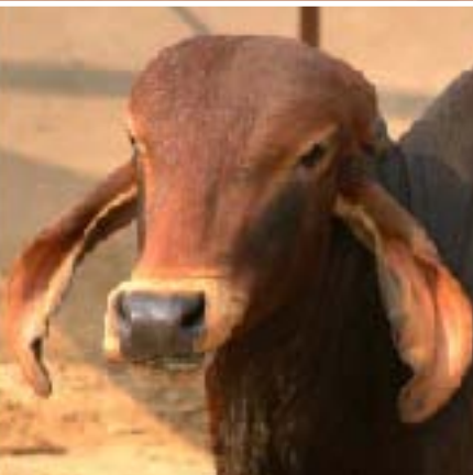
Early years - Nandi as a calf