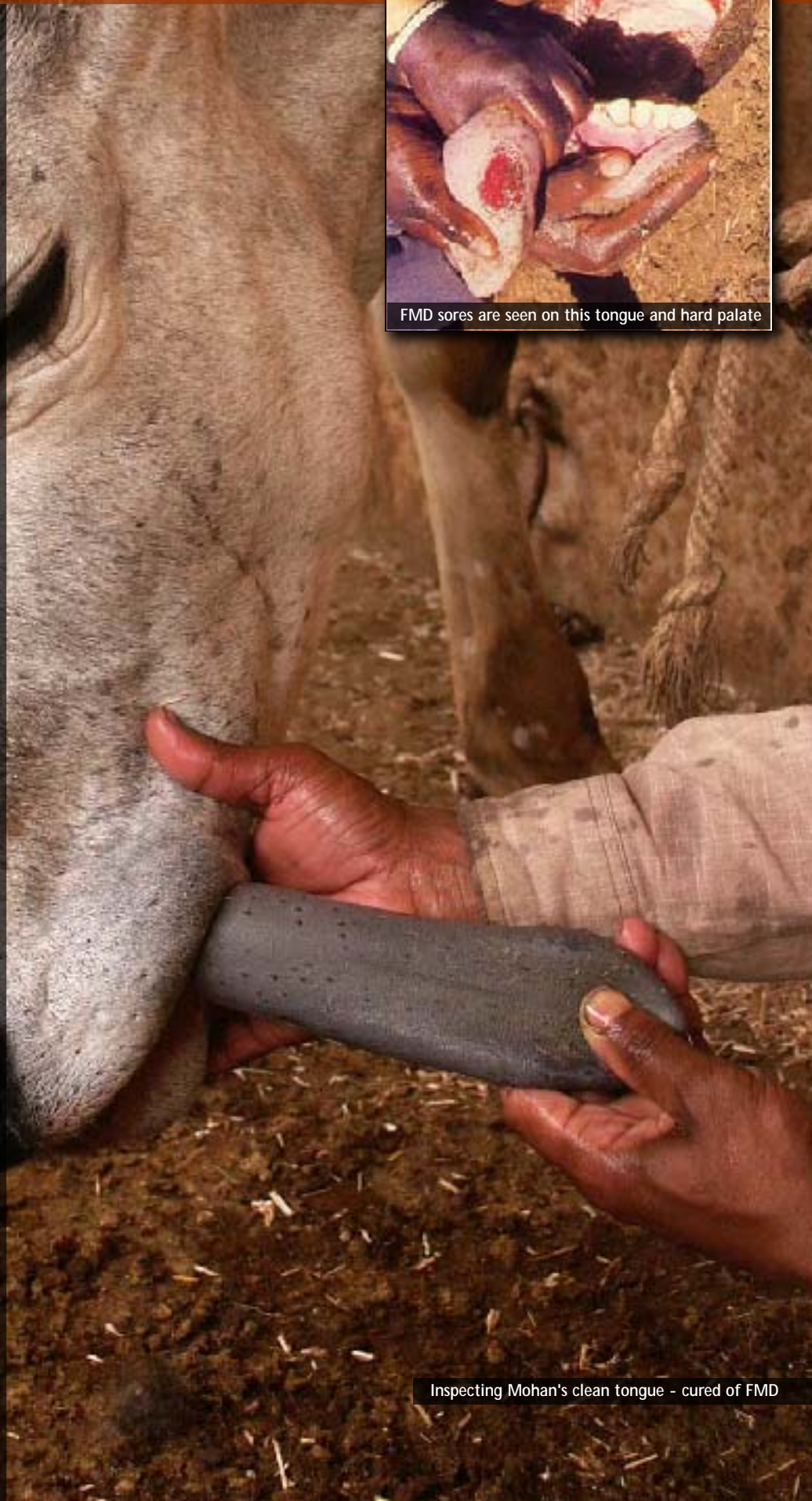
Inspecting Mohan's clean tongue - cured of FMD