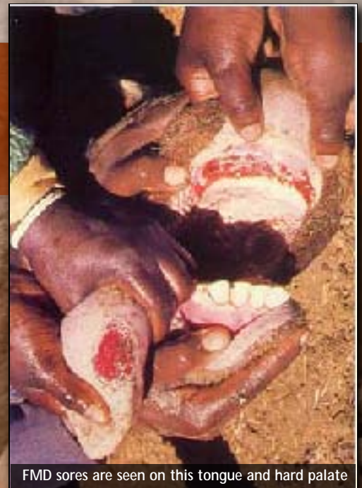
FMD sores are seen on this tongue and hard palate

We have found that all four ingredients are not necessary. Most recently we cured a mild case of FMD using only salt and tumeric.