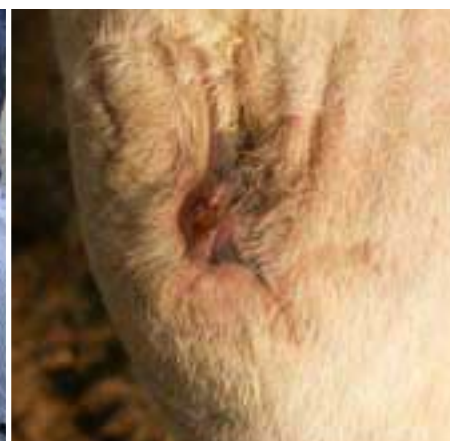
Somarasa's broken bone protrudes through his skin