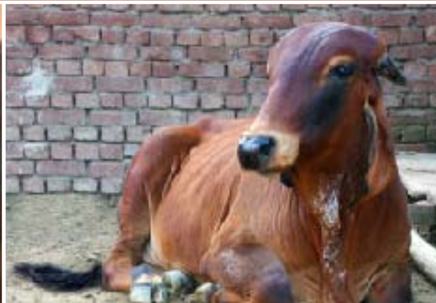
Nandi grown into a youthful and handsome three year old