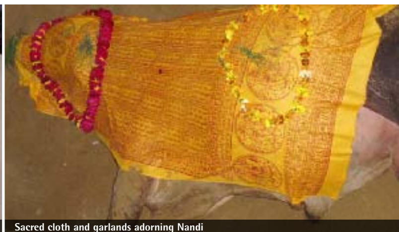
Sacred cloth and garlands adorning Nandi